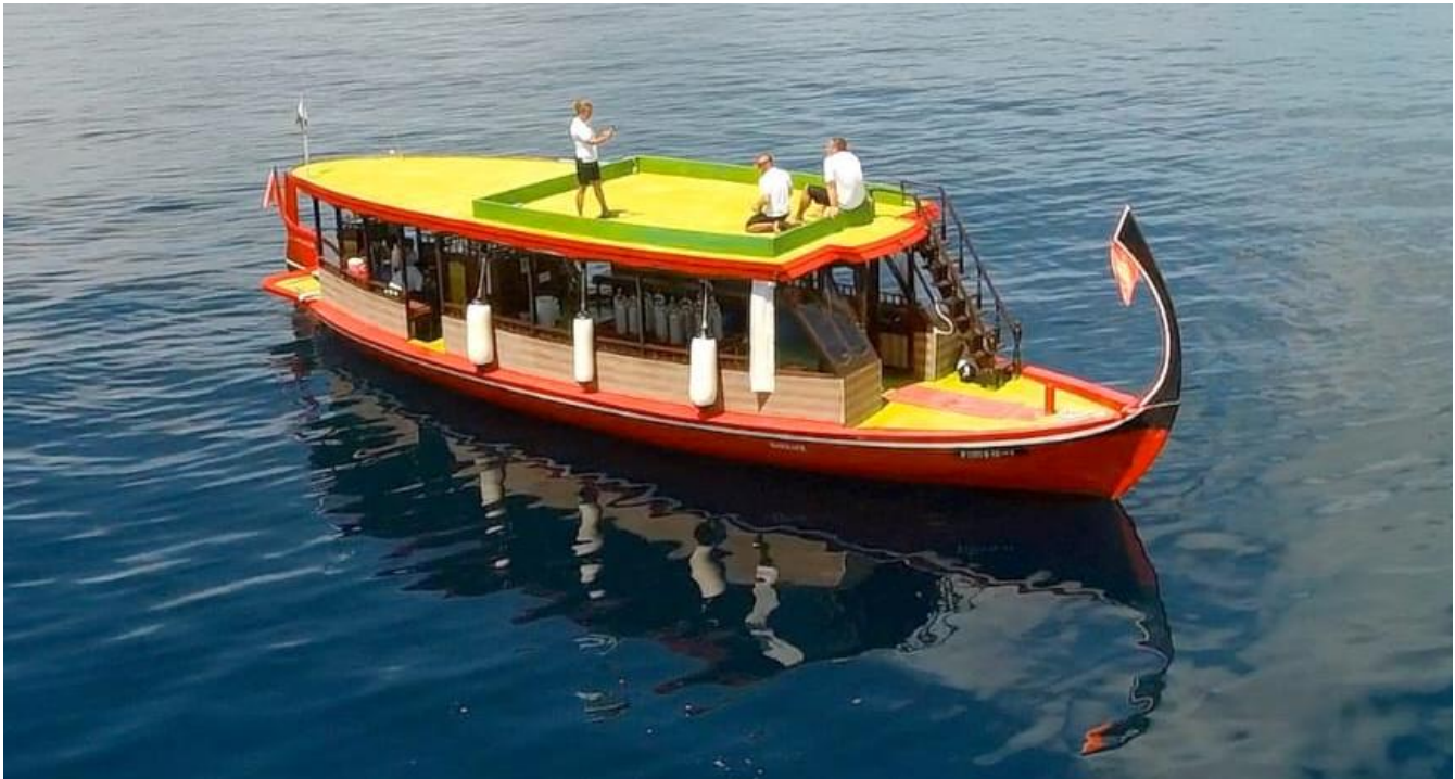
(Traditional Maldivian wooden boat, maximum guests capacity = 18 pax)

Good for bigger groups, this type of boat provides shelter, toilet, sundeck and a fresh water shower, it is not very fast but very charming and stable in the water because it is built by locals for the Maldivian sea. Very easy and comfortable ladder to get back on the boat after snorkelling